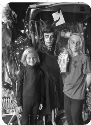
Trunk or Treat Winners 2019